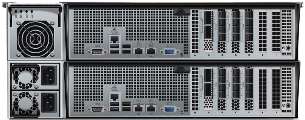
TrueNAS® M60 Rear